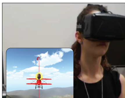
FIGURE 3. Cervical movement accuracy. The individual follows a moving target at 10°/s in flexion, extension, and rotation to the left and right while immersed in a virtual reality environment. Sensors in the head-mounted display measure the difference between the target and the individual's head position to give a measurement of accuracy.

Similarly to balance tests, neck torsion has been used to demonstrate a cervical afferent cause in some tests. Accordingly, abnormalities in eye follow or smooth pursuit when tested in the neck torsion position, compared to a neutral neck position, have been seen in those with WAD but not in those with central or peripheral vestibular pathology. 111,122 These abnormalities were also greater in those with whiplash who also had symptoms of dizziness. 119 In other studies, close associations were noted between performance on the smooth-pursuit neck torsion (SPNT) test and disturbance of reading, driving, and cognitive tasks. 41 This suggests that some common symptoms of posttraumatic neck injury might manifest from disturbed sensorimotor control due to abnormal cervical afferent input. However, others using a fully automated analysis of SPNT 26,54,58 have not found deficits to the same extent. This may reflect the importance of trained observers to determine and extract the appropriate elements of the signal for analysis. A test to address this problem may be the cervical torsion test. Recently, it has been suggested that nystagmus of greater than 2°/s during sustained neck torsion positions may be an alternative and more sensitive method than SPNT to demonstrate these abnormalities. 67 However, this was done in individuals with cervicogenic diz-